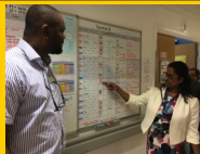
Identified patients on white board of GSF accredited Ward, Sunrise B, Barking Havering and Redbridge Hospital